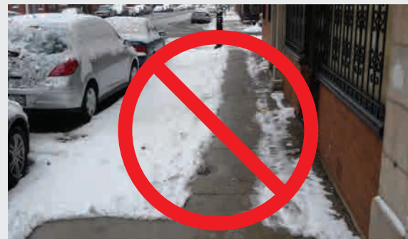
This path does not meet the width required in the Municipal Code.